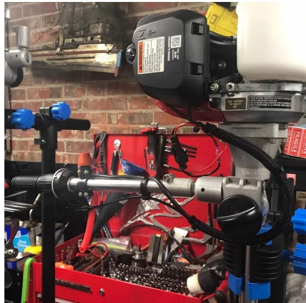
Sheath placement example for upgraded and RTR builds.

*All RTR and upgraded drives already have this completed.